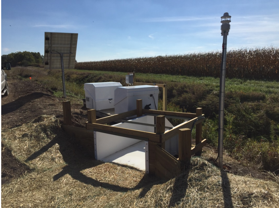
Figure 4. H-flume from Indiana site.