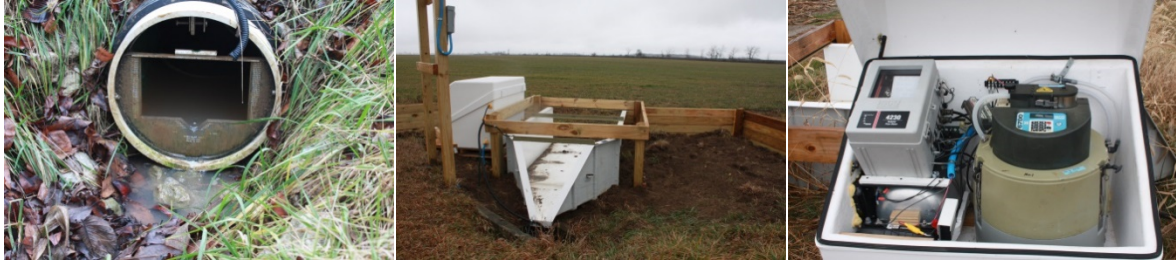
Figure 2. Example of EOF monitoring equipment in Ohio.