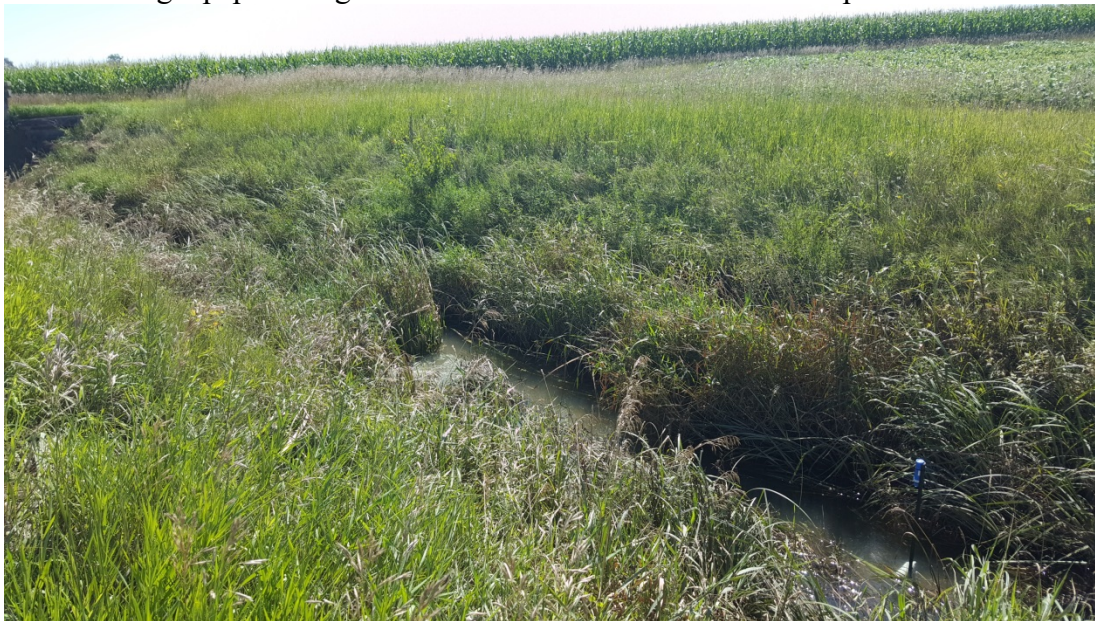
Figure 5. Minidot deployed in drainage ditch at EOF site.